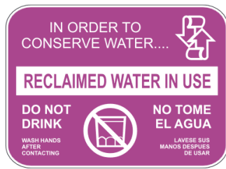
ID-SIGN-6 # 511239 (9" X 12")