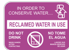
ID-SIGN-4 # 511226 (12" x 18")