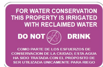
ID-SIGN-35 # 511224 (12" X 18")