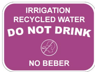
ID-SIGN-9X12-WRW # 511257 (9" x 12")

Note: Special legends, logos and layouts can be customized ordered.