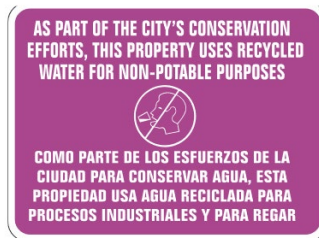
ID-SIGN-3 # 511223 (12" X 18")