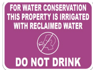
ID-SIGN-4x8 #511226 (4" X 8")