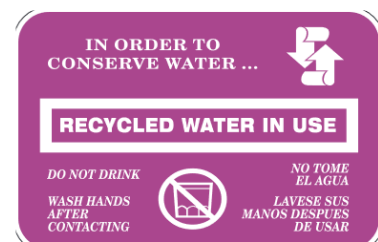
ID-SIGN-REC1218 # 511260 (12" x 18")