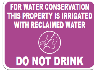
ID-SIGN-45 # 511229 (9" X 12")